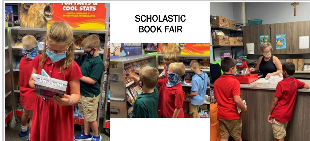
SCHOLASTIC BOOK FAIR

"St. Peter School provides a quality education built on Catholic values and teachings."