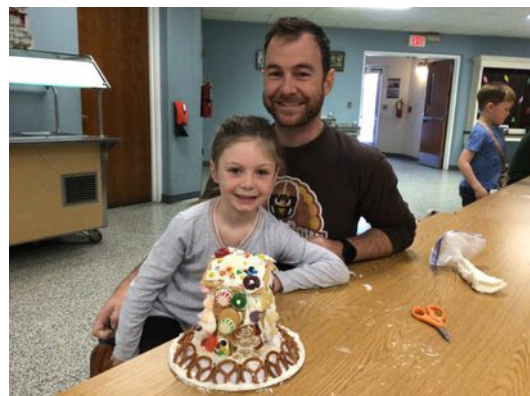
Kindergarten celebrated their annual Ginger Bread House making day with parents.