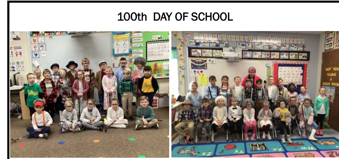
The St. Peter School Kindergarten students celebrated the 100th day of school by dressing as if they were 100 years old. They always enjoy this special day by participating in several activities. We have some great looking 100 year olds at our school!