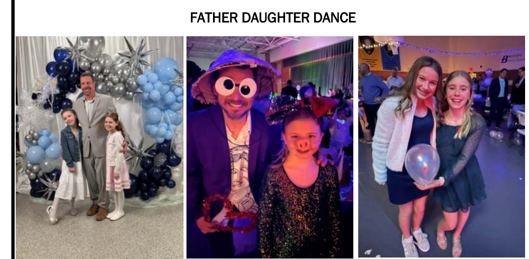
Once again the Father Daughter Dance was a huge success! We are so grateful to everyone who could attend. This event is loved by all. It is such a great opportunity to create the best memories for dads and daughters!