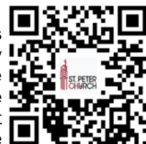
St Peter Church, Quincy IL Church Fund - 8288 https://pushpay.com/g/stpeterquincy