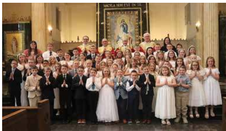
Under the Restored Order of the Sacraments, these young St. Peter parishioners received Confirmation and First Communion on April 29.

The first time our parish observed the Restored Order was in 2020, but the pandemic restrictions