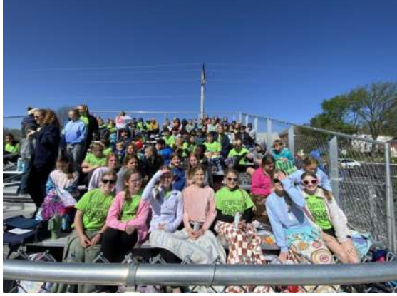
Students in grades 5-8 from the QCES as well as St. Mary, Mt. Sterling and Holy Family in Hannibal participated in the annual Olympic Day event held at QND. We are grateful to the QND students for helping in all of the events! The students had a great experience.