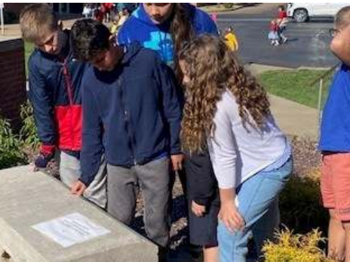
Our school "HOUSES" participated in a scavenger hunt which took them all around the school grounds. Each group collaborated together by finding clues, collecting information, and traveling from one destination to another.