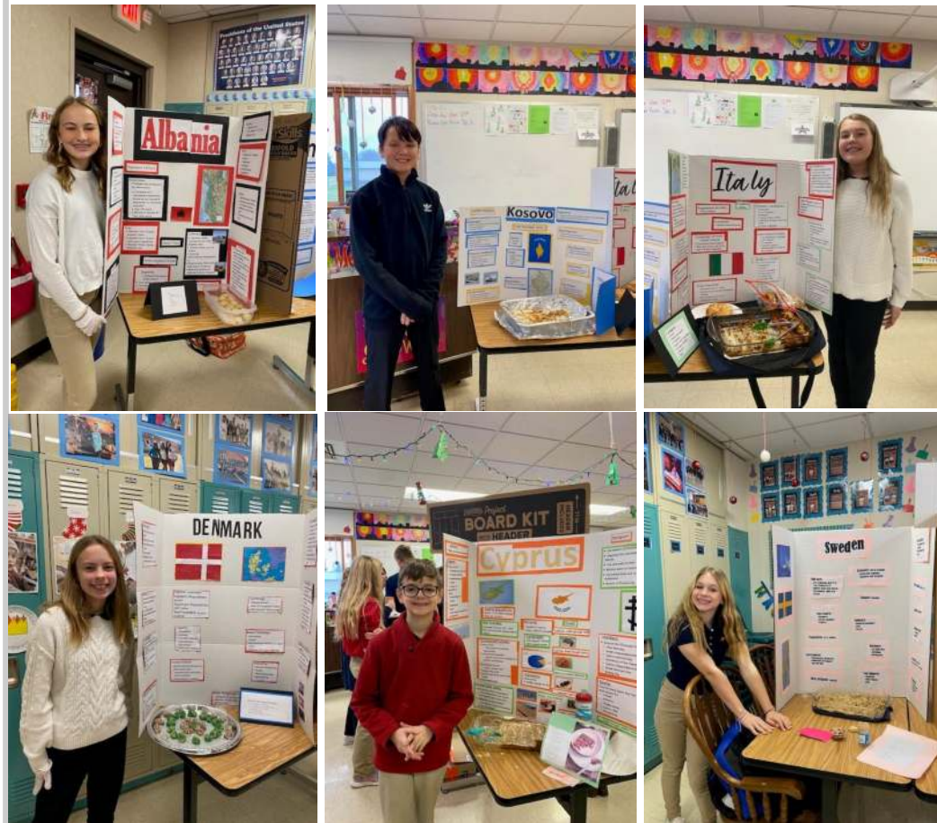
Seventh grade studied a chosen European country and shared their findings with visiting parents and staff.