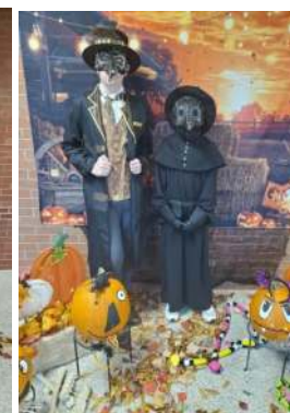
Student in grades 6-8 enjoyed the Halloween Bash held at St. Peter School!!!!