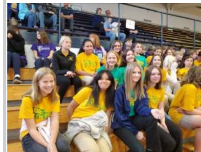
All four Quincy Catholic elementary schools, QND and St. Mary, Mt. Sterling celebrated mass at QND on Sept. 27!