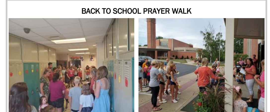
Many participated in the Back to School Prayer Walk to kick off the school year.