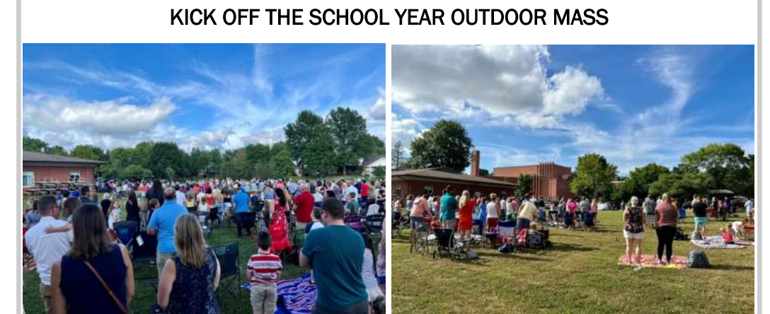
The turn out for the Kick Off the School Year Mass was overwhelming. It was great to see so many of our returning as well as new families celebrate Mass outdoors before dropping off school supplies and meeting the teachers and staff. We were certainly blessed with a beautiful evening to focus on the start of an exciting school year ahead.