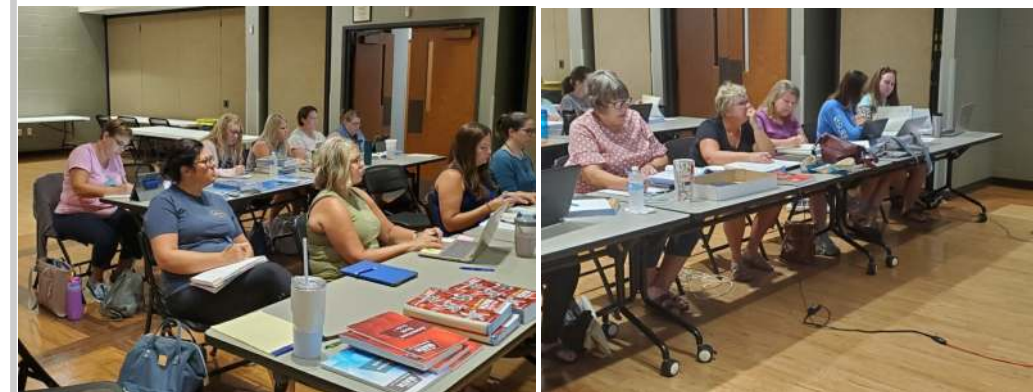
Teachers from the four Catholic Elementary Schools in Quincy met to learn more about a new math program: "Big Ideas" that has been adopted for grades 1-5 for the coming school year!