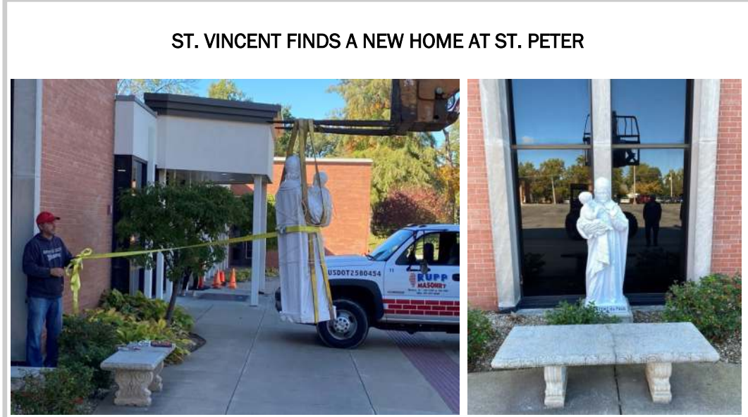
ST. VINCENT FINDS A NEW HOME AT ST. PETER