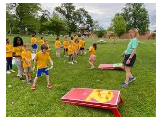
Grades K-2 participated in various activities as they enjoyed Read Day!