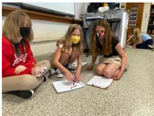
Students in 5th grade had an opportunity to learn about decomposers in their science lesson. They observed, measured and identified the parts of an earthworm.