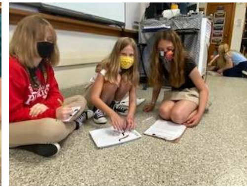
Students in 5th grade had an opportunity to learn about decomposers in their science lesson. They observed, measured and identified the parts of an earthworm.