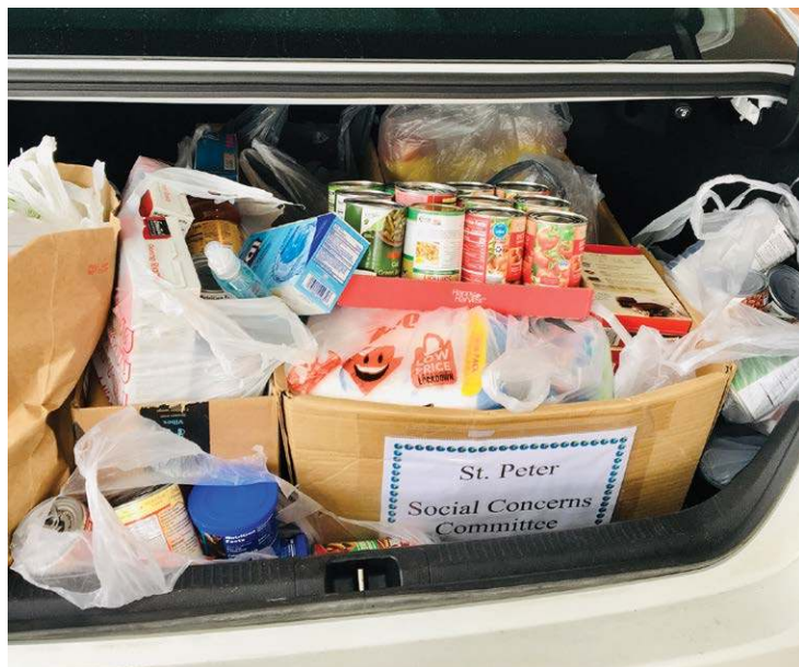
This collection from the Social Concerns Committee will help those in need during this difficult time.

"Sometimes, celebrating the Eucharist every week, we take it for granted," he says. "When it is taken away, there is a yearning to be a part of it. If