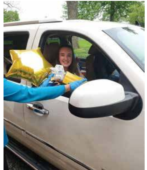
Though not the typical graduation experience, the St. Peter community managed to find a way to make the students feel loved and special.

If you would like more information about St. Peter School, please contact the school office at 217-223-1120.