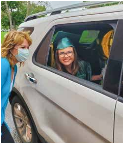
Eighth-grade St. Peter graduates were able to drive by to pick up supplies, receive their awards and diplomas, and be cheered on by their teachers and administrators.