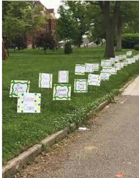
The names of each of the 2019-2020 eighth-grade graduates were specially arranged.