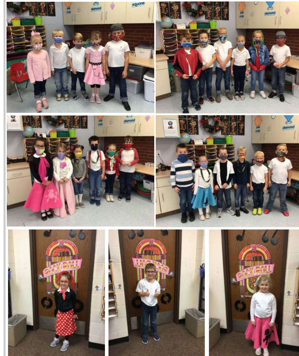
Oct. 27th marked the 50th day of school for our students. Our kindergarten classes celebrate this day by doing various activities. One of the things they really enjoyed was dressing as if they lived during the 1950's.