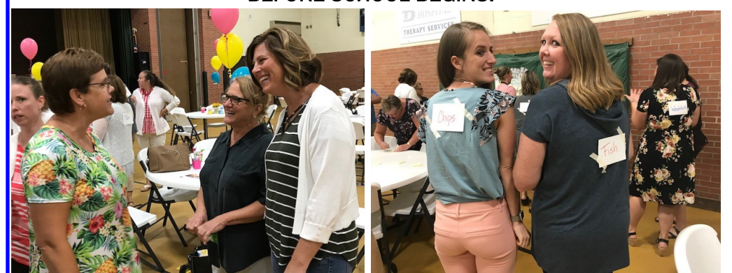
Teacher's prepare for the year by attending the all day faculty meeting this past Monday.