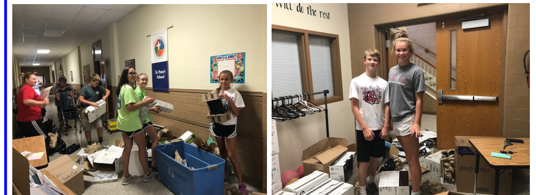
Several St. Peter School Alumni provided service by doing odds and ends around the school before the start of the school year!