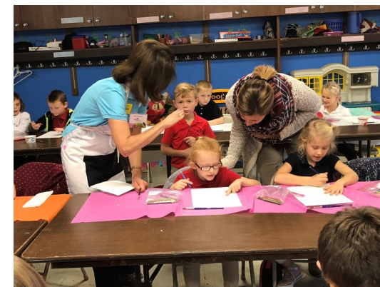
The Quincy Art Center came in to do smArt Kids art with first grade. They visit each classroom in grades K-8 2 times throughout the year. The students will also visit the Quincy Art Center.