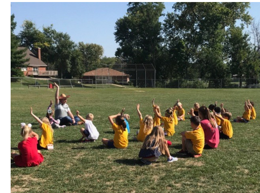
Playing Simón Dice (Simons Says) during the first day of Spanish class.