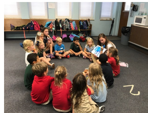
QND students read Oso Pardo, Oso Pardo, ¿Qué Ves Ahí? ( Brown Bear, Brown Bear, What Do You See? ) to a group of After School Spanish students who are using finger puppets to act out the story and learn colors in Spanish