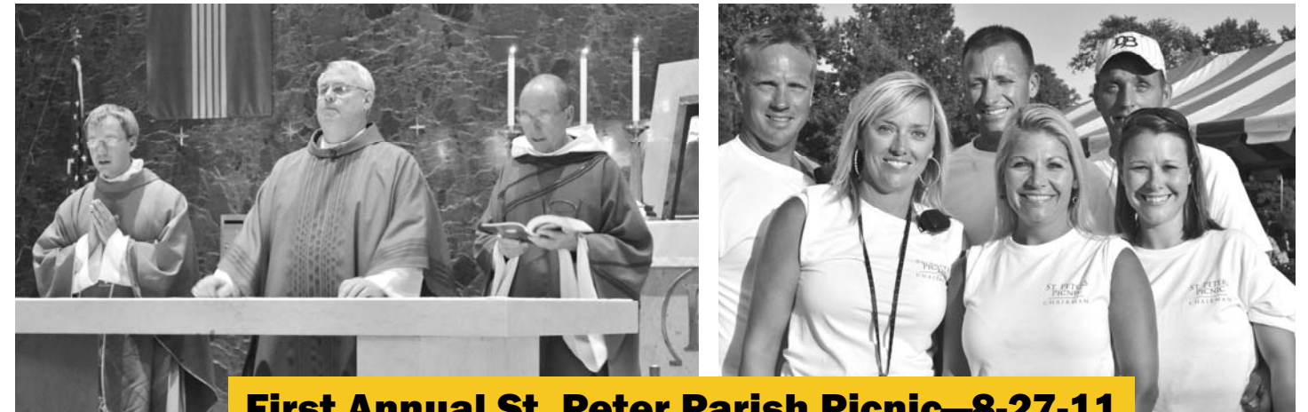
First Annual St. Peter Parish Picnic—8-27-11