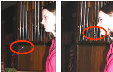
GOOD MIC PLACEMENT